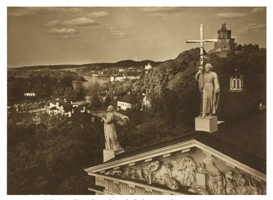
Fig. 5. Jan Bułhak, Vilnius from the cathedral campanile, ca. 1915.

from Jena University, appointed in winter 1916 as the conservator of Lithuania responsible for the registration of architectural monuments in the region. During his surveys, he organised popular lantern lectures addressed to German soldiers on the cultural and artistic landscape of the conquered lands, focusing in particular on Vilnius and illustrated almost exclusively with Bułhak's slides. The most captivating panoramas, views of the city and single monuments also filled the pages of Weber's booklet edited by the Zeitung der 10. Armee. 53 Wilna. Eine vergessene Kunststätte, defined in the introduction as a guide and a souvenir for the German soldier, was a comprehensive art history of the city's monuments filled with 135 illustrations. Starting with 7 encaptivating panoramas of the city, it continued with the views and details of the monuments under discussion. As already mentioned, the majority of illustrations consisted of Bułhak's survey photographs, which formed a visual narration in its own right. In the opinion of the German Kunstoffiziers on the Eastern Front, it was as important