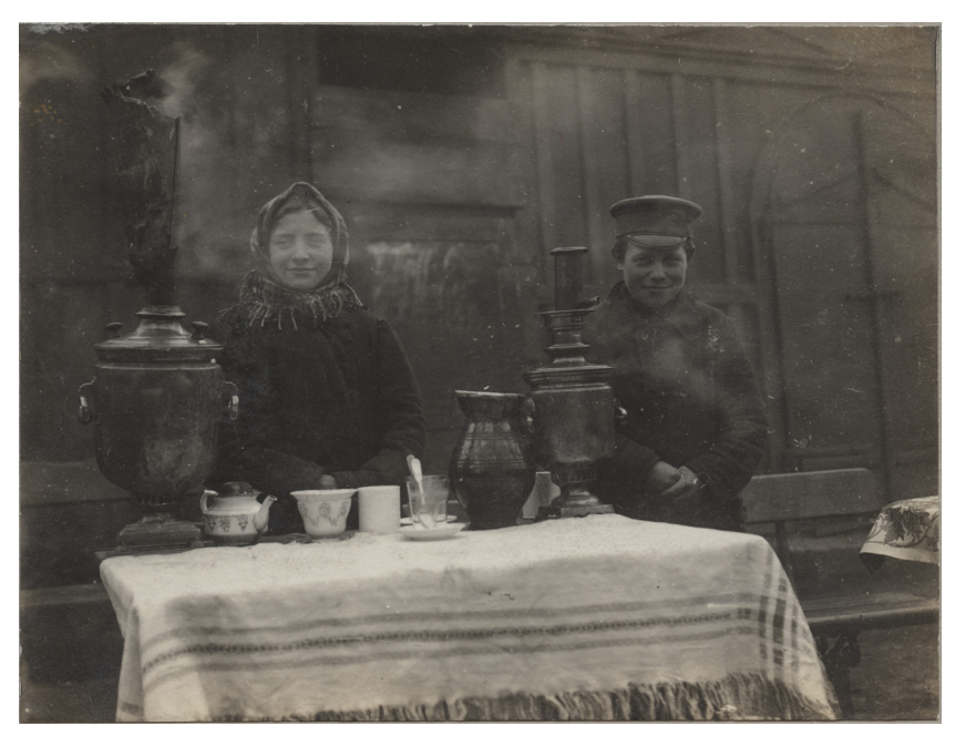
Fig. 2. Behmcke, A boy and girl with a samovar at the Łęczyca market, ca. 1917; Cracow, Ethnographic Museum, inv. no. III 17419.

possibly soldiers or military officials, whose names do not appear on the lists of the Kommission 's employees. Surprisingly, this collection goes well beyond the scientific and reveals several photographic personalities. Behmcke's pictures of the Warsaw Jewish sellers or of the Łęczyca region peasants are taken with an artistic eye and sensibility, and should be described more in terms of artistic portrait studies than ethnographic typology (fig. 2). Hans Praesent, the Kommission 's librarian and scholar responsible for statistical research, was particularly fascinated by the street market scenes of the towns and villages. Arved Schultz took numerous picturesque ethnographic impressions of the crowds before Sunday mass, playing children, and women carrying water.