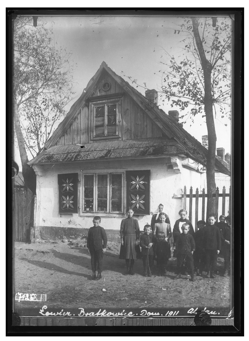
Fig. 4. A photograph from the Society for the Protection of Ancient Monuments' archive reproduced in the Wieś i miasteczko (Warszawa, 1916) and the Polnisches Bauernhaus (Berlin, 1917).